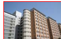
(ITO CAMPUS, KYUSHU UNIVERSITY)

STUDY TOUR : One common lecture, Practical Environmental Engineering, is organized such way that the subject combines lecture with site visit. Understanding of environmental engineering can be promoted by combining lectures and site visit. A half-day to one full day field trips include visits to waste incineration plant, landfill site, water treatment plant, and nuclear power plant. In addition, the study tour organized once or twice a year, this study tour includes visits to the sites of the development of renewable energy resources and environmental restoration in Kyushu.