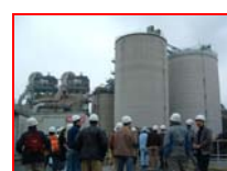
(STUDY TOUR 2005)